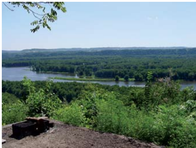
Nelson Dewey State Park features many beautiful overlooks and hiking trails.

The entire complex is housed in an old stone and brick building across Main Street from a new event center. The restaurant is light and pleasant with wraps and sandwiches on the lunch menu and a full menu for dinner, in addition to five varieties of Potosi beer. The museum, which features regional brewery memorabilia,