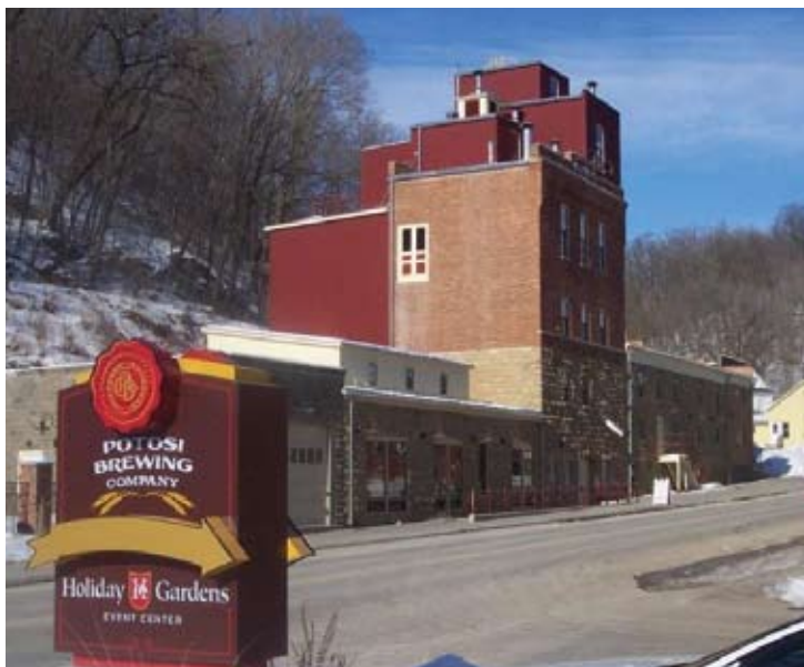
Above: For the price of admission to the National Brewery Museum ($7) you get beer exhibits and a glass of fresh Potosi beer. (Tim Skwiot)