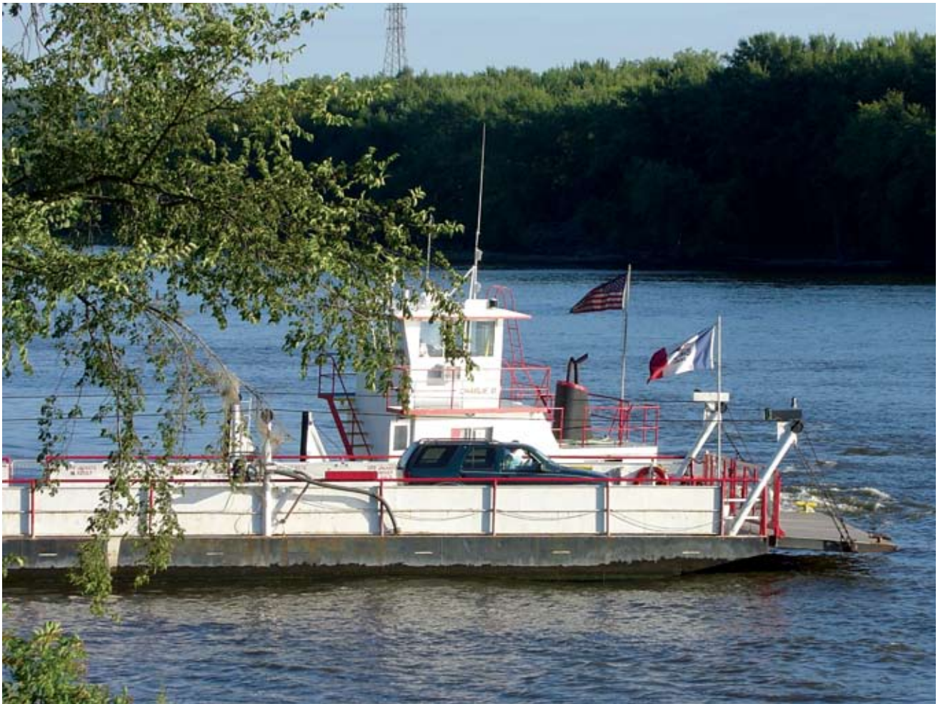
The Cassville Ferry carries tourists and commuters across the Mississippi from Wisconsin to Iowa and back. The nearest bridge upriver is at Prairie du Chien, Wis., and the next bridge downstream is at Dubuque.