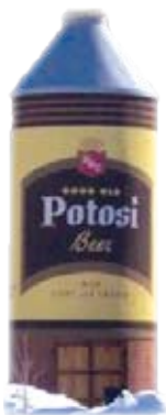
Left: The bottom of the "World's Largest Cone-Top Beer Can," across the street from the Potosi Brewing Company, opens up into a bar. (Tim Skwiot)