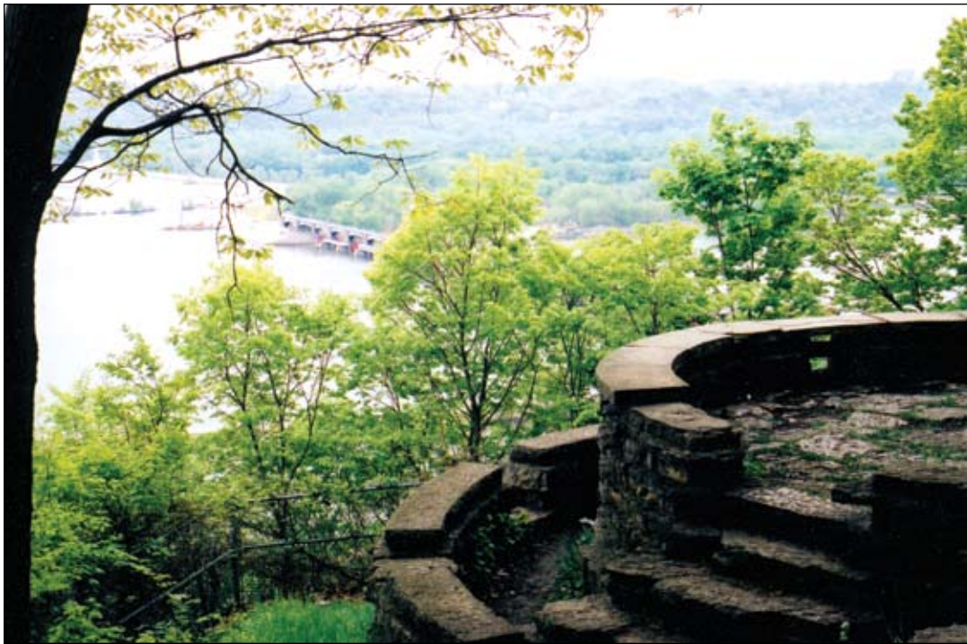
Eagle Point Park above Dubuque is rich with architectural stonework and fabulous overlooks. (Reggie McLeod)