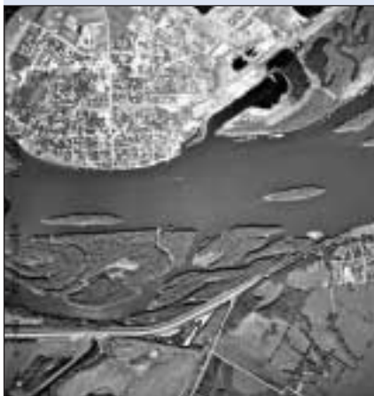
Above: This 1994 aerial photo shows Camanche, Iowa, at the top and the downriver edge of Albany, Ill., on the lower right.

For a taste of area history visit Heritage Canyon historical park in Fulton, Illinois. Fulton is also home to one of only two fully operational authentic Dutch windmills in the nation, right on the Mississippi. The mill is open for tours in the summer. 5 𐀀