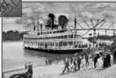
Right: Riverfront at Clinton, Iowa, on an old postcard.

This is the second in a series that will explore communities along the Mississippi from Davenport, Iowa, to Minneapolis, Minn., the route of the 1854 Grand Excursion. We will complete our journey up the river at about the time the re-enactment of the Grand Excursion begins in Davenport in June 2004. For more information on the Grand Excursion 2004, call (513) 381-6700. Also see the Big River website for links.