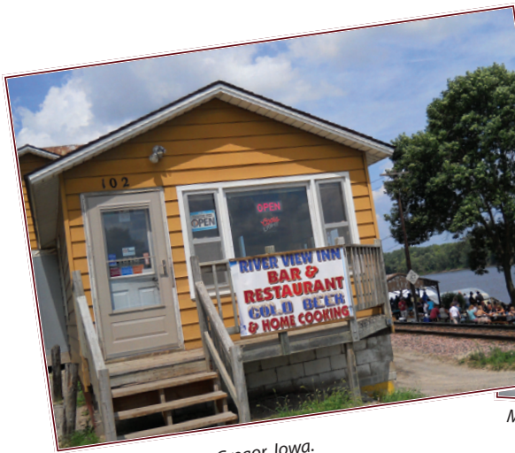
River View Inn in McGregor, Iowa.