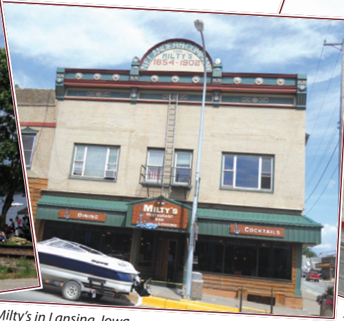
Milty's in Lansing, Iowa.