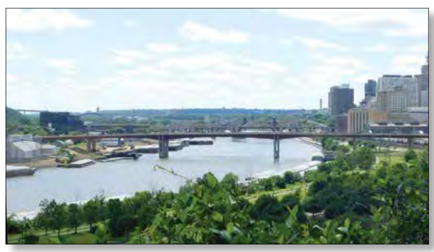
Indian Mounds Park — You can see the High Bridge in the distance on the left.

From downtown Red Wing, Barn Bluff looks like a formidable climb. However, if you can find your way to the trailhead, on East Fifth Street, you'll find that the trail is wide and not too steep, though it's a good walk. Once on top, the