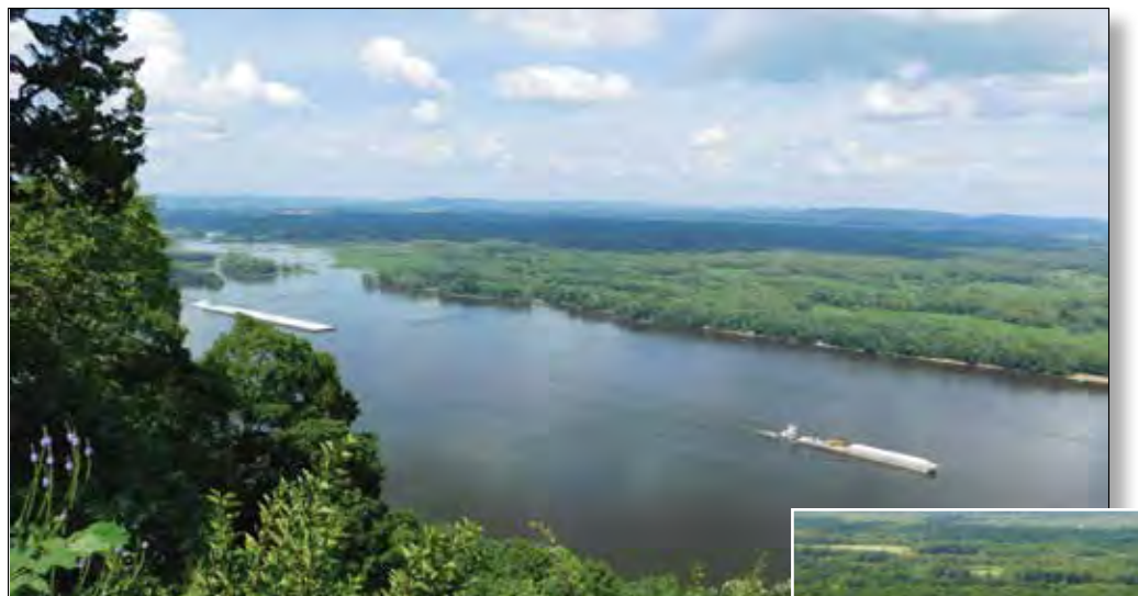
Left: Great River Bluffs State Park Below: Buena Vista Park