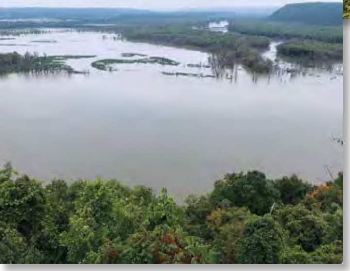
Pikes Peak State Park — Wyalusing State Park is on the bluff on the right. Below it a railroad bridge spans the Wisconsin River.

This is my other favorite overlook. It looks across the river to the bluffs of Wyalusing State Park towering over the confluence of the Mississippi and Wisconsin rivers; McGregor lake and countless sloughs and islands; and a lot of river. A prowlike viewing structure juts out from the bluff, which opens up the view even more.