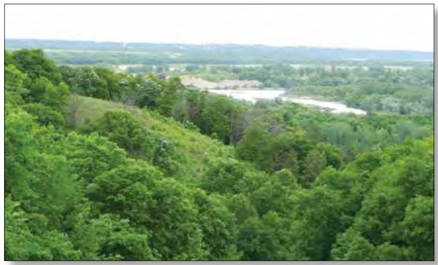
Pine Bend Bluffs Scientific and Natural Area — The sand and gravel piles are on Grey Cloud Island.

height and open space can be a bit overwhelming. If so, look down at your feet and appreciate the prairie plants. Walk out to the end and you'll see the city and plenty of river, islands and bluffs.