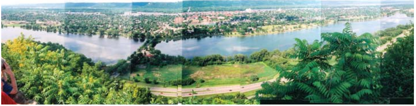
The view from Garvin Heights in Winona, Minn., extends 34 miles, from Alma, Wis., to Mount Trempealeau, on a clear day.

The Main Channel hugs the base of the bluffs for about four miles, then at the little town of Minneiska , makes a quick turn to the east bank, as if to avoid the Weaver Bottoms , where the Whitewater River joins the Mississippi. A few decades ago, this large backwater area was full of emergent plants that drew waterfowl and fish. When the plants and wildlife quickly disappeared in the 1980s, this area became the poster child for island-building projects to repair backwater habitat loss on the Upper Mississippi. The Army Corps of Engineers and other agencies built two odd-looking islands in it in 1987, hoping to break