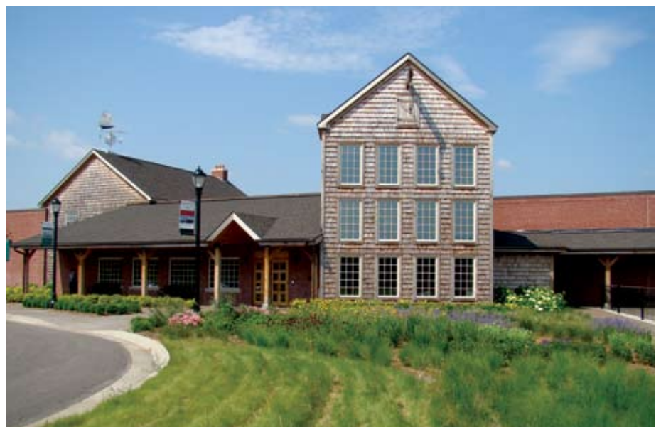
The Minnesota Marine Art Museum overlooks Winona's commercial harbor. From the terrace or even from inside the gallery, you can watch towboats work.