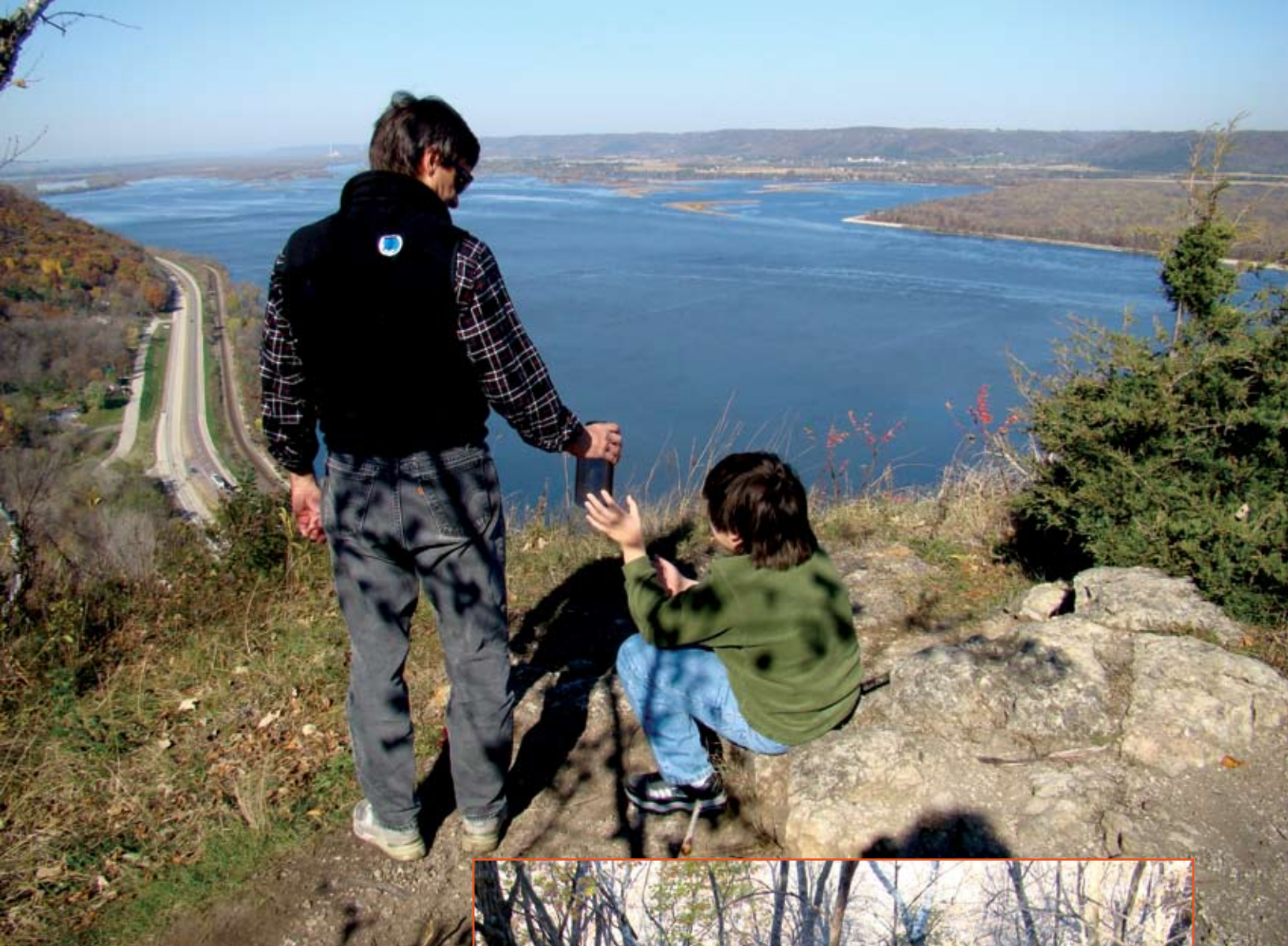
Toiling to the top of the stairs at John Latsch State Park puts you up where eagles fly. The dike road to Whitman Dam (Lock and Dam 5) is just across the river in this view. The maze-like Whitman backwaters are inside the dike.