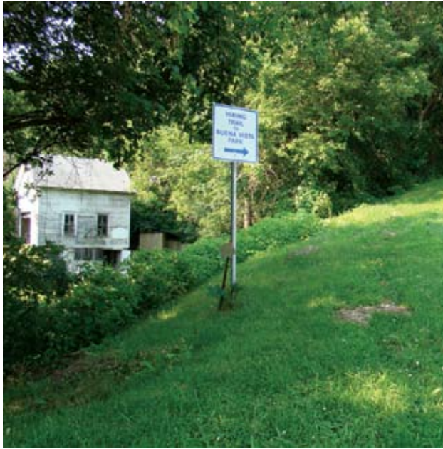
A woody trail leads to the top of the bluff at Alma. It begins right in town, above the highest street on the hill.