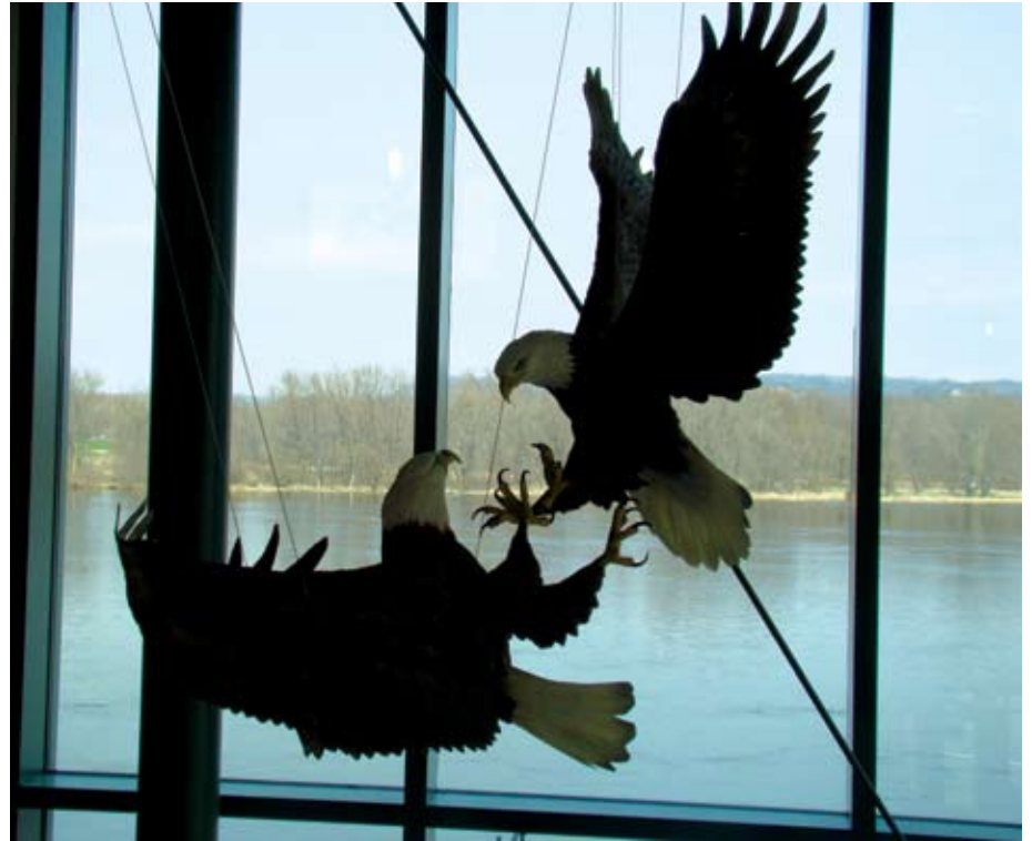
A life-sized sculpture of two eagles hangs in the open atrium of the National Eagle Center in Wabasha, Minn.

Just upriver from Weaver Bottoms, go for a hike in the Weaver Dunes , an unusual formation of sandy plains and hills left over from glacial runoff. Today it's home to a number of rare plant and animal species, including Blanding's turtles. Half Moon Landing , near West Newton, has a boat ramp and a canoe landing, both of which provide access to the Main Channel and Half Moon Lake, in the