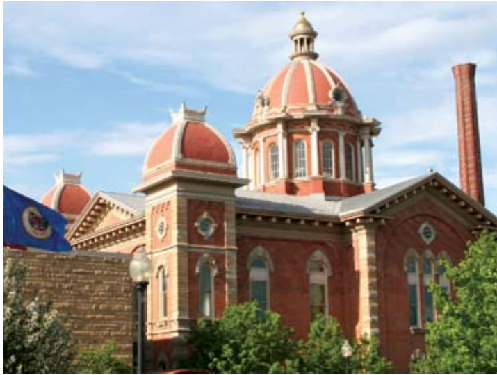
Above: Hastings City Hall.