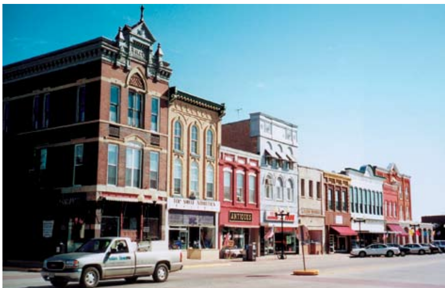
Hastings has 63 buildings on the National Register of Historic Places, including 33 commercial buildings downtown.

As you continue upriver toward St. Paul Park (pop. 5,070 in 2000), the countryside has a settled, rural feel.