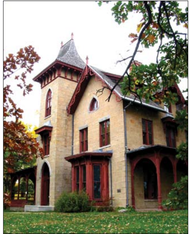
Right: Le Duc House in Hastings, Minn.