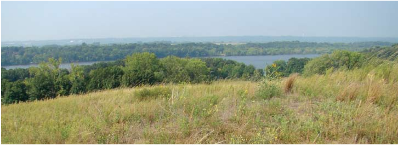
From Grey Cloud Dunes Scientific and Natural Area, a rare prairie with sand dunes that rise in waves cresting 10 to 20 feet, you can see Lower Grey Cloud Island. (Reggie McLeod)