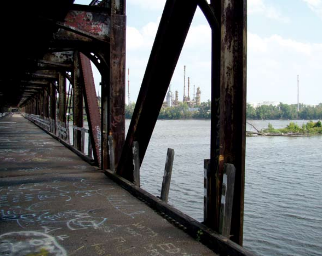
Three marinas and the Marathon Refinery across the river are visible from the old swinging tollbridge, the St. Paul Park Bridge. The decrepit bridge's future is uncertain.

eventually be breached by a tunnel or bridge.