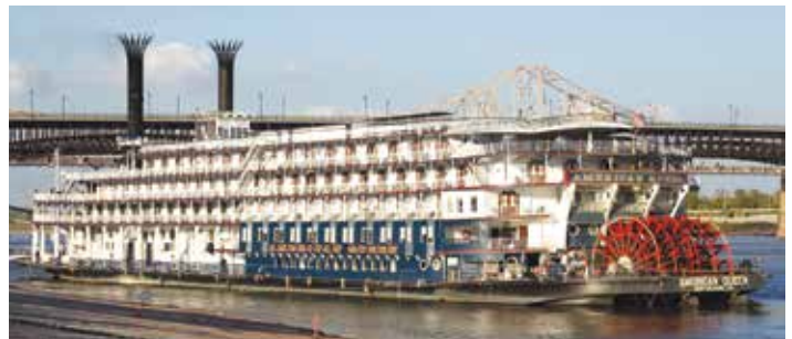
The American Queen docks in St. Louis in 2008, near the Eads Bridge.

The data turned out to be fairly precise. We squeezed under the bridges and made it to our landing only to find