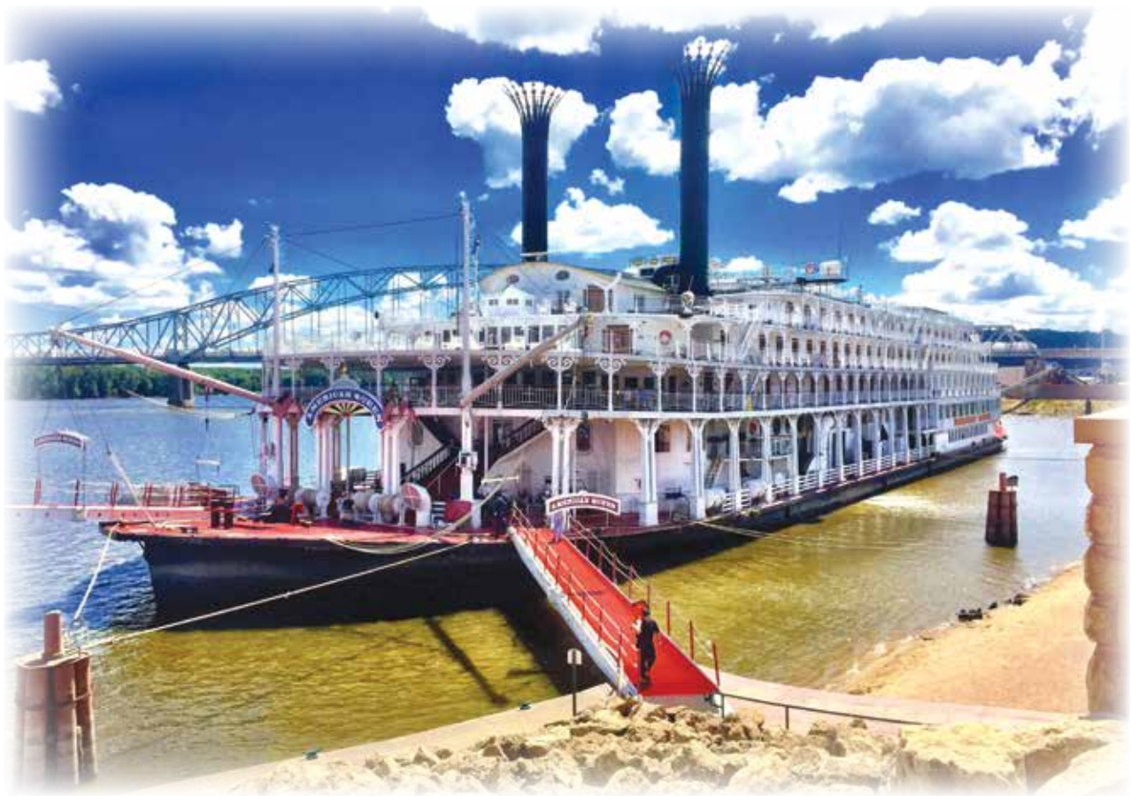
The American Queen docks in Dubuque, Iowa, in 2015.